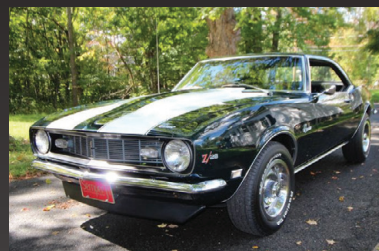
1968 CHEVROLET CAMARO Z28