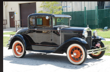
1930 FORD MODEL A