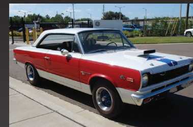
1969 AMC S/C RAMBLER