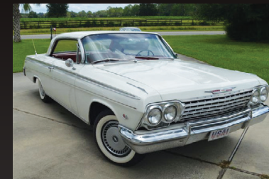
1962 CHEVROLET IMPALA SS