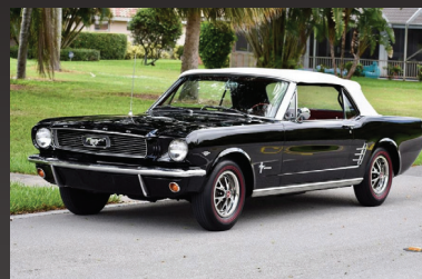
1966 FORD MUSTANG