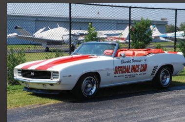
1969 CHEVROLET CAMARO PACE CAR