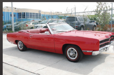
1969 FORD XL