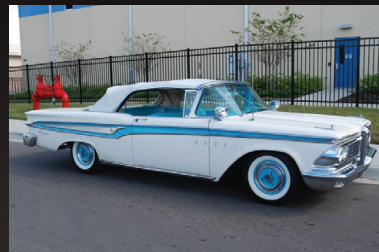
1959 EDESEL CORSAIR