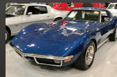
1970 CHEVROLET CORVETTE

SEE ADDITIONAL CONSIGNMENTS AT CARLISLEAUCTIONS.COM